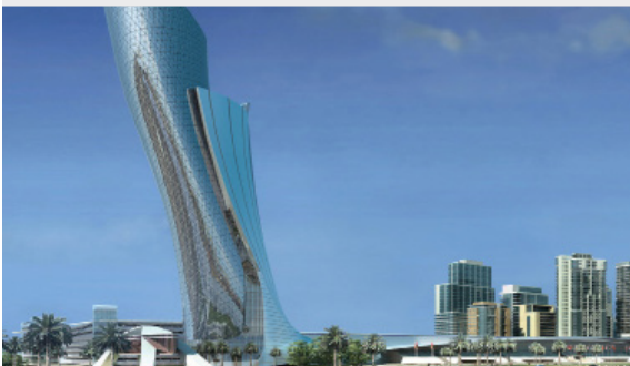
Abu Dhabi National Exhibition Centre, UAE