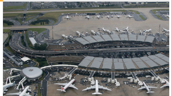
Paris-Charles De Gaulle Airport, France