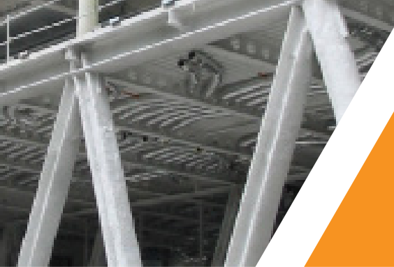
SABIC SADAF, Saudi Arabia