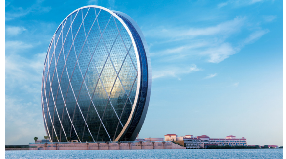
Aldar Headquarters, Abu Dhabi, UAE