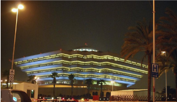
Ministry of Interior, Saudi Arabia